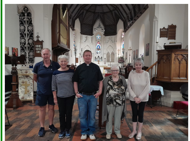
St Peter's Eco Team